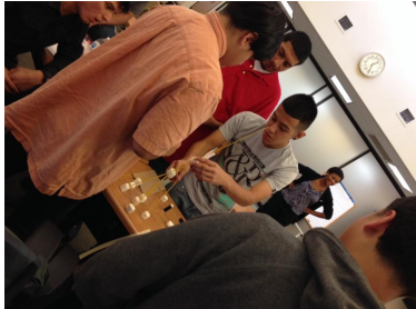
Participants have a team building exercise.