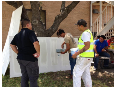
Participants learn how to tape and float with D.A.V. Painting.