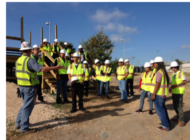
Students get a tour of Turner Construction's CONRAC project.