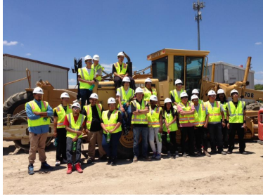
Participants enjoy the F.A. Nunnelly Company job site visit.