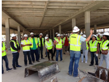
Joeris General Contractors take the students on a tour of John Marshall Harlan High School job site.