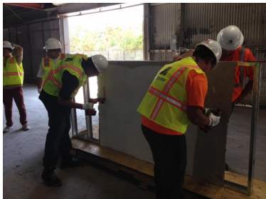
Baker Triangle gives a lesson in installing metal studs and drywall.